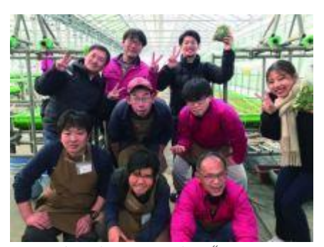
Internal exchanges at the "Heart-warming Farm"